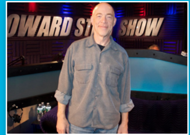
JK Simmons Wednesday