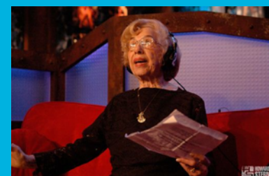
Rapping Granny Fruity Nutcake